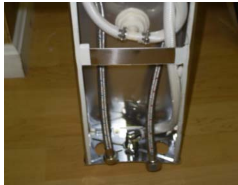
Cold & Hot Pipes

The distance from the top of the shower panel to the floor should be 85 in.